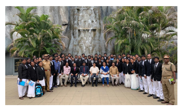
Judicial officer trainees from Tamil Nadu State judicial Academy