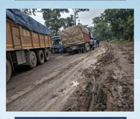
Journey in swampy terrain with the exceptional care of loaded animal