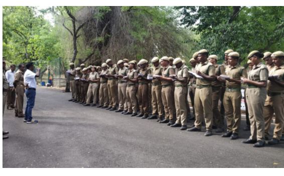
Forest Guard apprentice trainees from Tamilnadu Forest Department