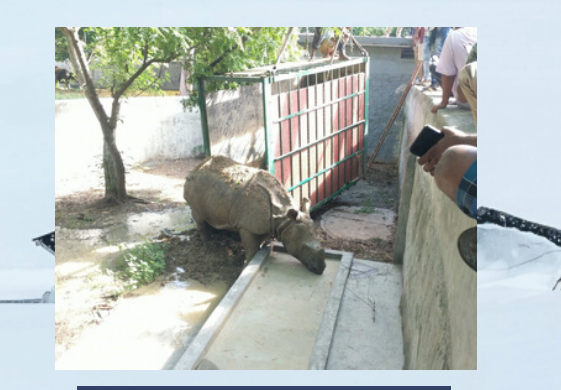
Rhine exploring her New Enclosure