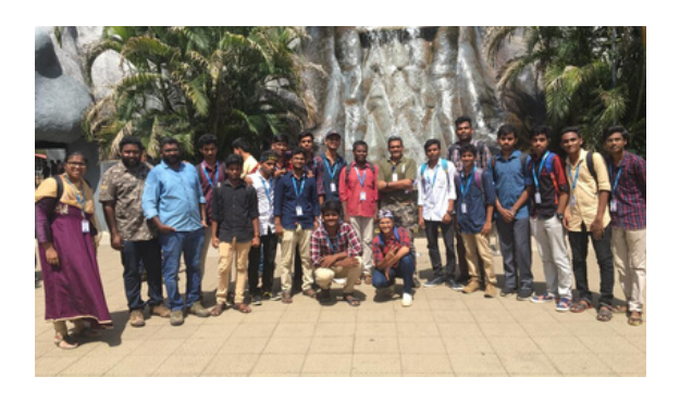
Wildlife tracking programme -MVC students