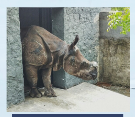
Ramu exploring his New Enclosure