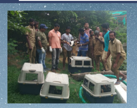
Team involved in identification of animals for animal Exchange