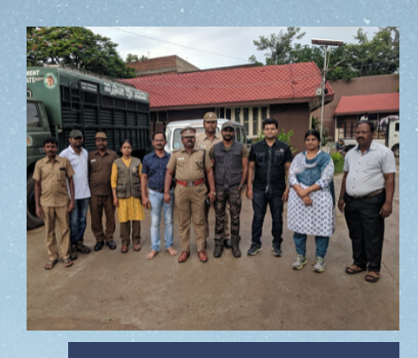
AAZP & NZP Team